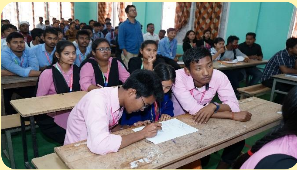
Science Day : Students participating in Quiz competition