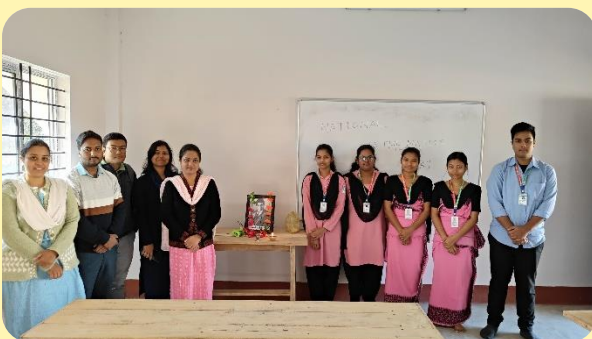
Celebration of National Mathematics Day