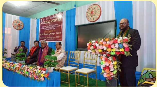
National Seminar on “Modernization and Development: Growing Tension in the Society due to Intergenerational Gap”