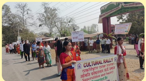
Students participating in cultural rally during College week