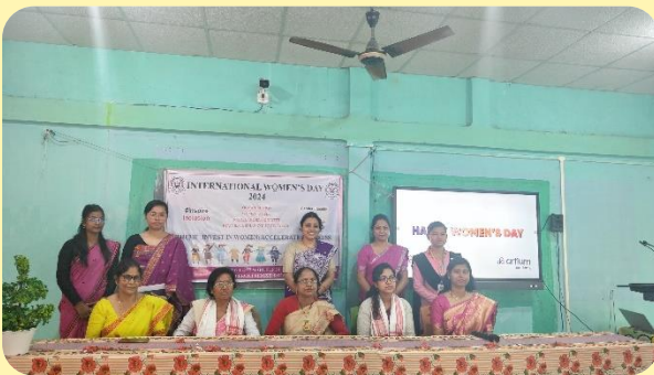
Celebration of International Women's Day