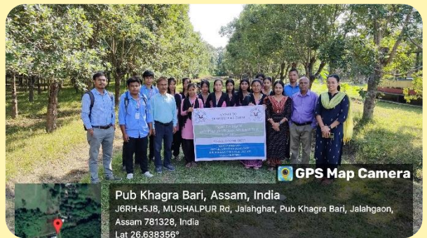
Educational field visit to Muga P2 Farm, Jalah organised by Dept. of Zoology